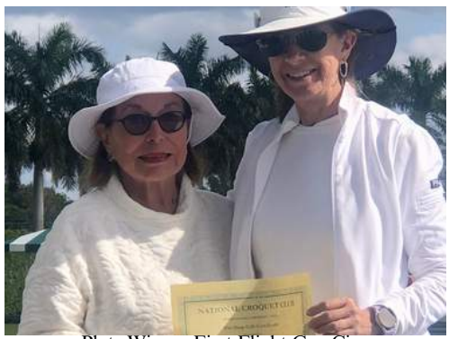
Plate Winner First Flight Gay Cinque