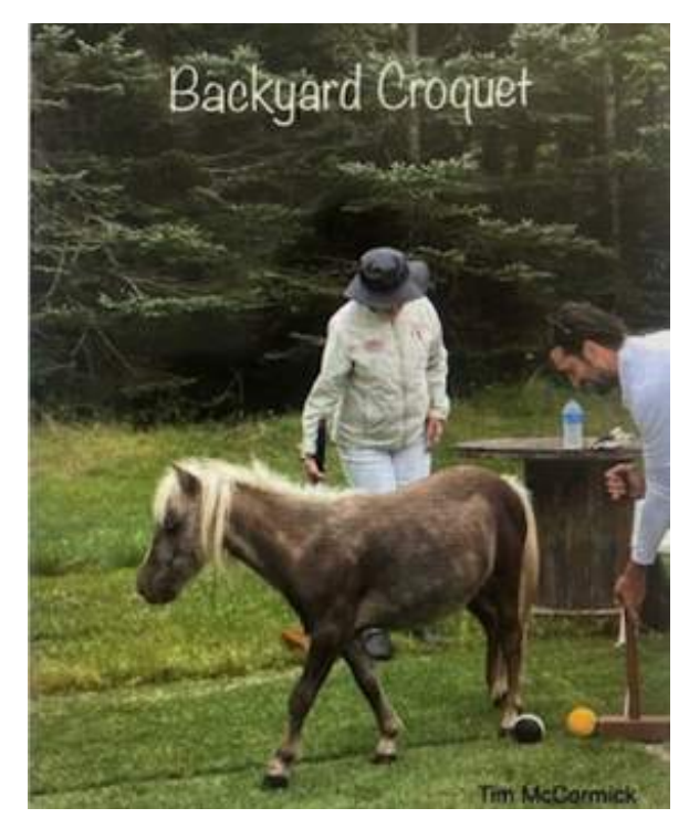
Practice practice practice!